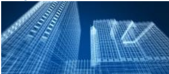
Construction & Development