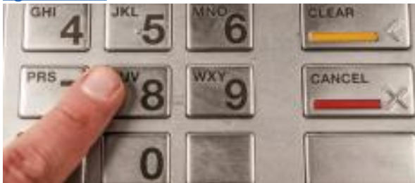
Banking, Investment & Financial Services